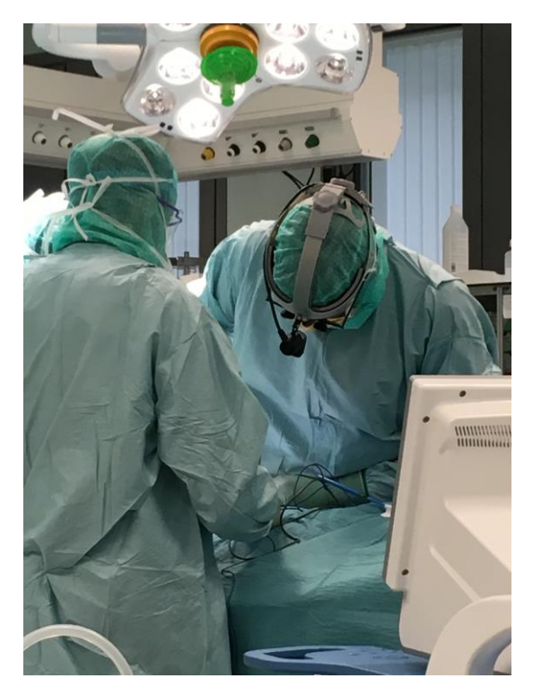
Figure 1 Surgeon during operation with his back and neck bended and his arms in abduction.