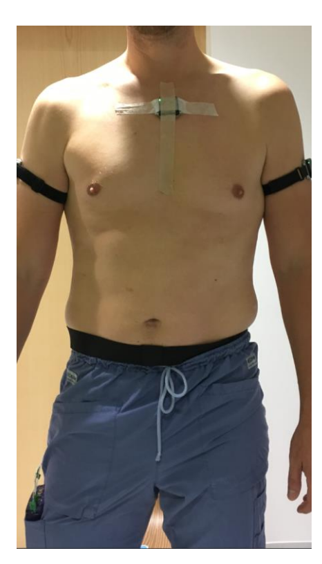
Figure 2 (left) Wearable wireless motion tracking sensors placed on the surgeon before the surgery. Head's sensor is not depicted in this photo.