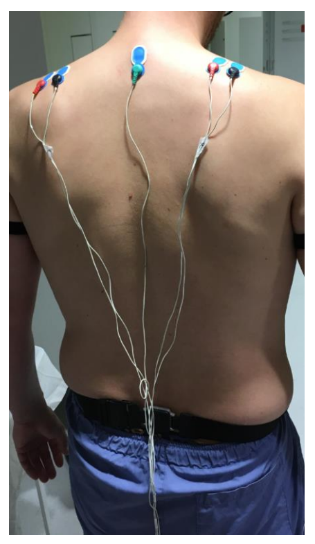
Figure 3 (right) Electromyography surface electrodes on the descending trapezius muscle. Green is the around.